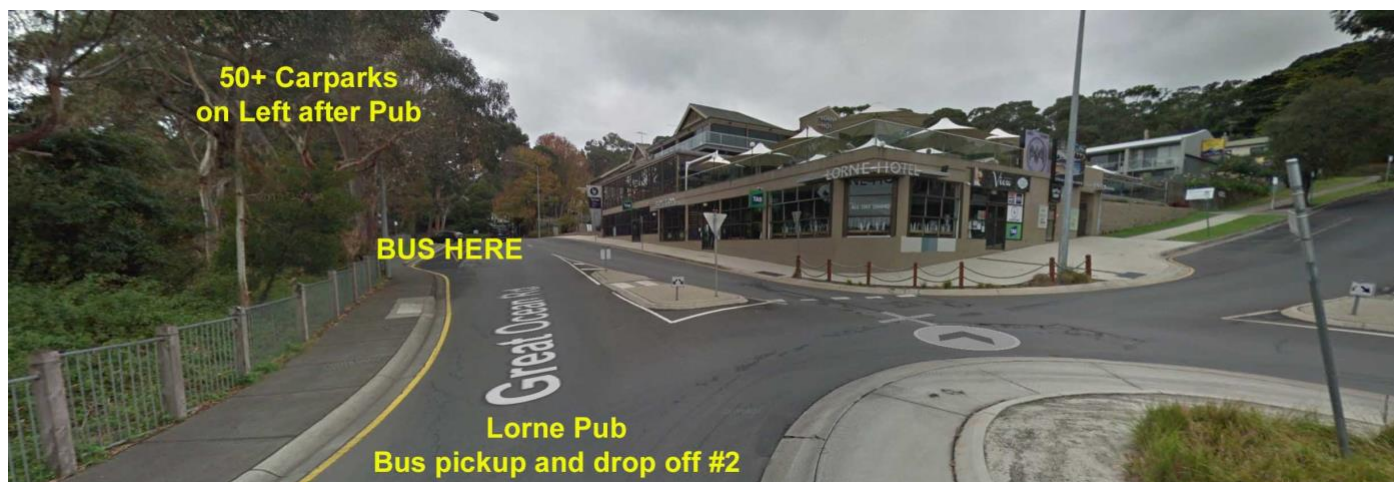
ABOVE VIEW OF THE LORNE PUB AND BUS STOP #2