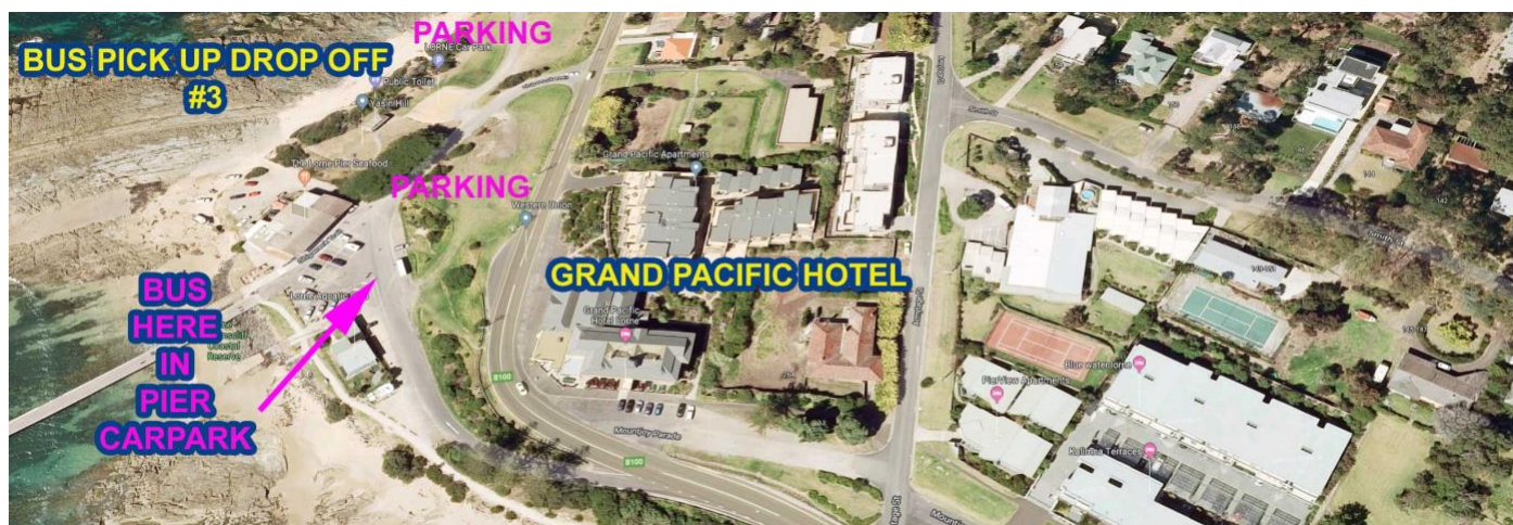
ABOVE AN OVER VIEW OF THE GRAND PACIFIC HOTEL AND CARPARKING AT THE PIER AND BEYOND

BUS PICK UP AND DROP OFF #3 LOCATION – GRAND PACIFIC HOTEL / LORNE PIER PLEASE CHECK CAR PARKING RESTRICTIONS, PARK AND WALK SAFELY TO THE BUS STOP WHERE POSSIBLE PARK ON GRASS AREA, CHECK IF DRY FIRST BUS STOPS ARE NOT MANNED BY VOLUNTEERS